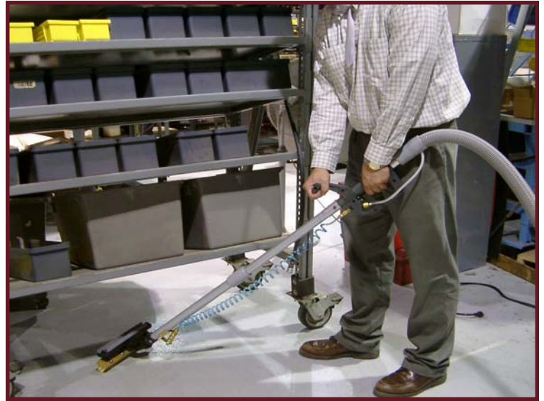
Optional off-aisle wand shown.

The SCV 28/32 offers an optional on board off-aisle wand and squeegee tool ideal for cleaning areas where the machine cannot go. The telescopic wand adjusts for operator comfort. Compact and lightweight, the tool can be conveniently attached to the rear of the machine and always available for use.